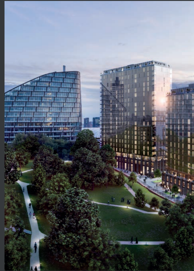
Above Meadowside, Manchester