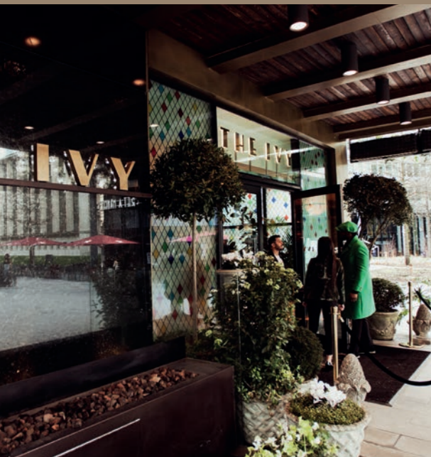
Left The Ivy Spinningfields

Manchester's food scene is as varied and vibrant as its art and culture.